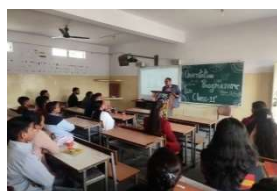
Orientation Program 2023