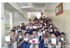
Mother's Day celebration