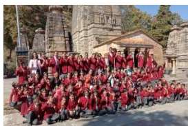
Trip to Katarmal, Kosi