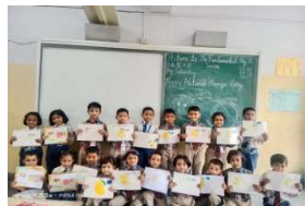
Mango day celebration