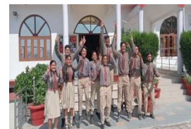
Board exam result celebration