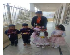
Fool Deli Activities