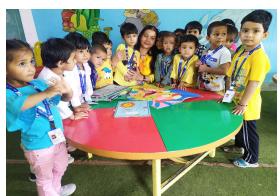
Card Making Activities